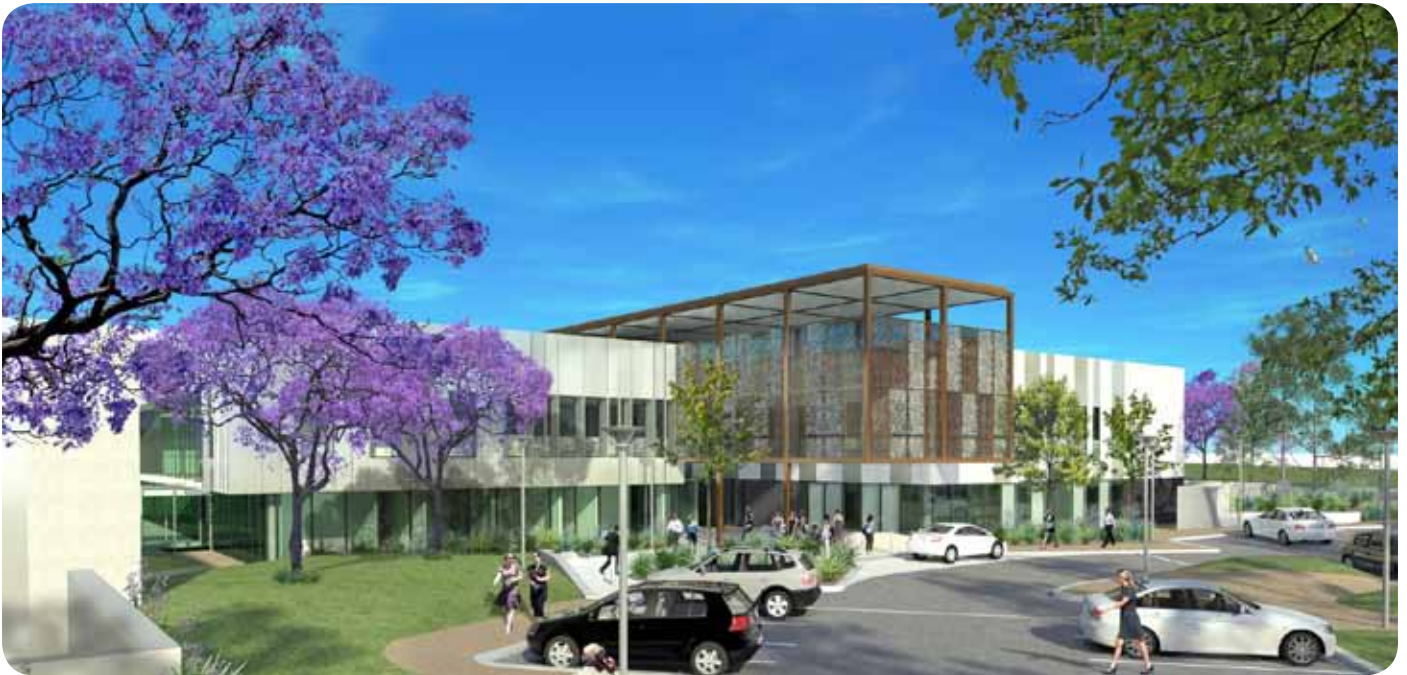
An artists impression of the new centre

Construction work has started on a new state-of-the-art pathology centre and expansion of the State's Comprehensive Cancer Centre at the Queen Elizabeth II Medical Centre. The Projects, valued together at more than $54million, are the first of two new capital works projects to be built at the QEII Medical Centre over the next six years.